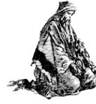
ISAIAH IN FUTURE TIME