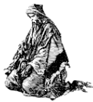
ISAIAH IN REAL TIME